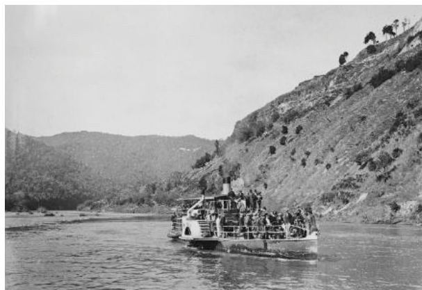
Fig. 4. Left: Hatrick’s Accommodation House at Pipiriki, ca. 1900. [Photo: Alexander Turnbull Library, Ref: 1/1-020952-G used with permission]. Right: The paddle steamer ‘Waimari’ and passengers, on the Whanganui River, below Pipiriki, ca. 1900. [Photo: Alexander Turnbull Library, Ref: PA1-q-014-4405 used with permission].