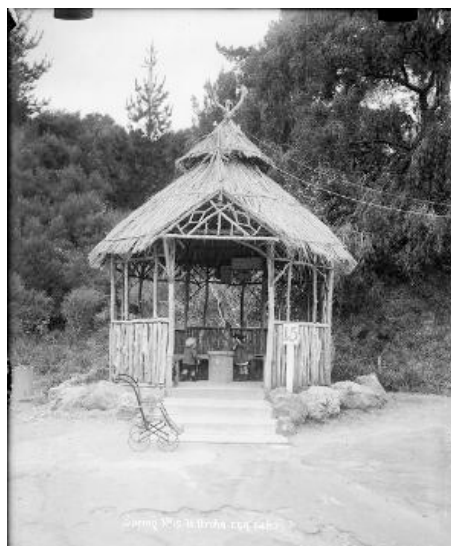
Fig.2. The gazebo built for No. 15 Spring at Te Aroha: "View of a man and two children in the summer house, a wooden gazebo with a thatched roof, at the 'No. 15' mineral spring in the Government Tourist Domain at Te Aroha. A hand pump for providing drinking water is in the centre, with a sign above it that reads: 'The public are warned against removing mineral water in bulk or using it at the spring for other than drinking purposes / by order'. Photograph taken circa 1910s, by Frederick George Radcliffe." [Photo: Alexander Turnbull Library, Ref.: 1/2-006352-G]

*Data from Appendices to the Journal of the House of Representatives