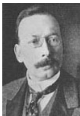
Fig. 1. A.S Wohlmann. Appointed as Government balneologist in 1902, he was responsible for chronicling the chemical composition and alleged curative properties of New Zealand's hot springs. He is particularly remembered for his work in developing Rotorua as a spa town. Although he may have intended Rotorua to rival the spas of Europe, the reality was different: Rotorua, Te Aroha and Hamner instead provided an impetus to the fledgling tourism industry.

Bottles of Lemon & Paeroa on supermarket shelves and television advertisements that include pictures of bathers in hot pools are the legacy of a nineteenth century Government initiative to exploit the numerous occurrences of geothermal springs as spas in the European tradition: bathing in hot waters and drinking cooled waters for the relief and possible cure of a variety of ailments. Central to this initiative was the appointment of Arthur Stanley Wohlmann in 1902 as the Government balneologist (Fig. 1). 1 His first task was to undertake a survey of New Zealand's hot springs in order to determine which might be most effectively used (Table 1). 2