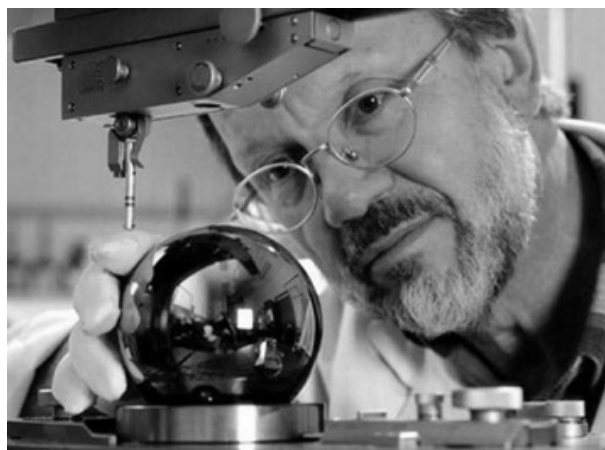
Fig. 2. A silicon sphere made for the Avogadro project at CSIRO by the Australian Centre for Precision Optics ( csiro.au )

The Avogadro project 11 involves a collaboration between Germany, Italy, Belgium, Japan, Australia and USA aiming to measure the ratio of the mass of the silicon 28 atom to the mass of the IPK in order to redefine the kilogram in terms of the Avogadro constant, N_A . The principle of the experiment is to count the number of atoms in a 1 kg nearly perfect single crystal silicon sphere (Fig. 2). Silicon was chosen because it is one of the best known materials and can be grown as large, high purity, and almost perfect single crystals. The precisely known lattice parameter of the crystal allows the number of atoms to be determined from macroscopic measurements. However there are issues with determinations of the natural isotope composition of the silicon.