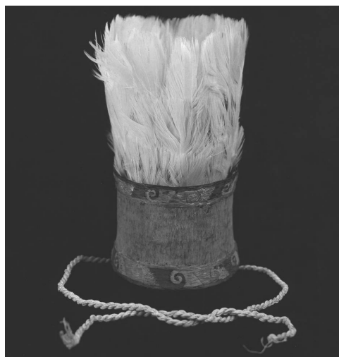
Fig. 2. High-level destructiveness analysis of synthetic membranes without touching the 8th century parchment of the Codex Eycckensis. This revealed a polyvinylchloride polymer with 30 % (w/w) monomeric plasticizer; after removal of the membranes, the Codex could be conserved by the application of an innovative parchment leafcasting technique – see ref. 13.

However, the degree of intervention does not explain at all why analysis is proposed, requested, or executed, and by what party. More information is needed about the expectations of the requestor in terms of how analytical results will